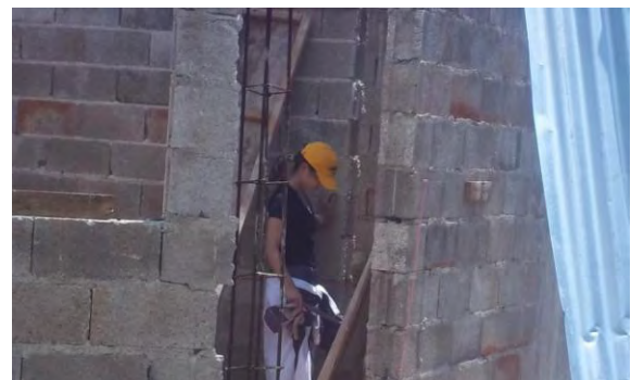
Volunteer on the building project